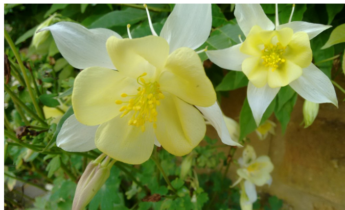
A beautiful Aquilegia