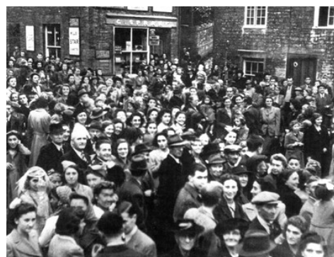
VE Day in 1945

The area known as Knapp at the south west corner of the village was in the past called The Borough. This was where fairs would have been held in the past and was always the gathering place in times of celebration.