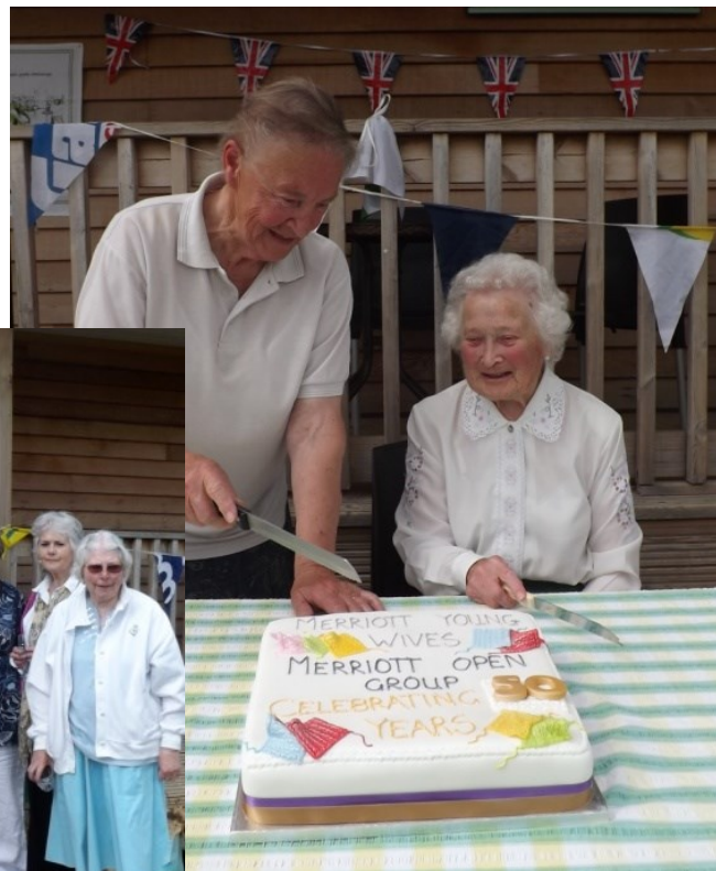
A glass of bubbly was raised to the continued success of the group and to remember absent friends.