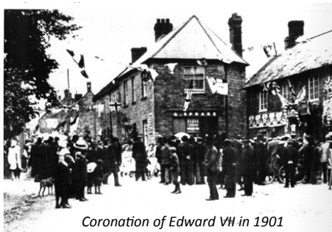
Coronation of Edward VII in 1901

Place names and street names can often give an insight in to their history.