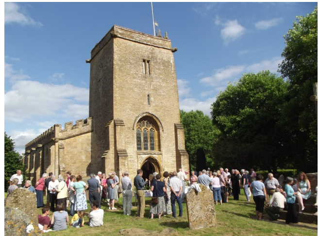
Post Concert tea, All Saints Church, Merriott